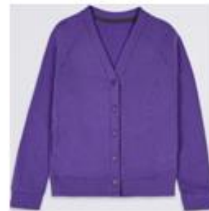
Purple Cardigan or Sweatshirt