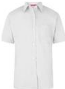
White T-Shirt or White Polo Top