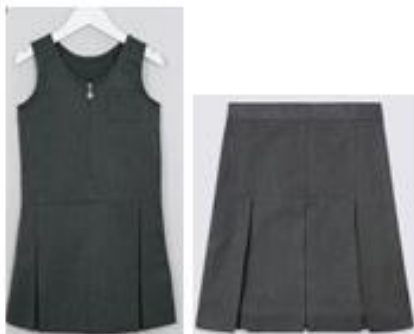
Grey or Black Dress or skirt Black school shoes/trainers (avoid branded trainers)