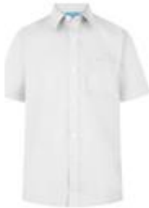
White T-Shirt or White Polo Top