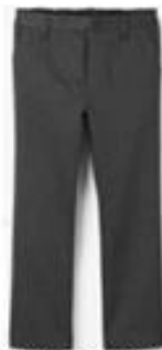
Grey or Black trousers